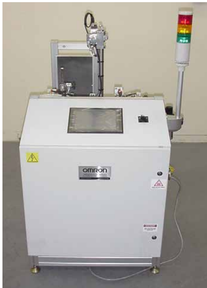
The Can Flange Inspection System's front view shows the control panel and the operator panel.

Omron's solution served to lower total production cost and improve product quality while increasing profitability. At the same time, the system enhanced consumer satisfaction and helped to protect brand reputation through improved consumer safety. In addition to preventing faulty product from reaching the customer, automated inspection through the manufacturing process helps identify and automatically remove the defective items from the manufacturing line to increase production efficiency, reduce downtime, cut down on waste and lower production cost for an overall increase in profit.