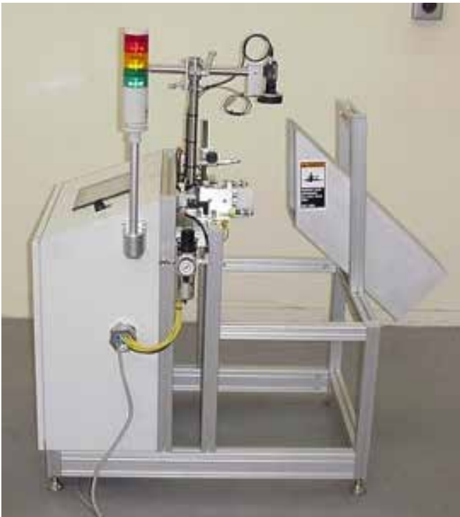
A complete Can Flange Inspection System was built by an Omron machine builder partner.

Constant line stoppages due to jammed equipment negatively impacted production efficiency and increased both line downtime and waste. In addition, containers with a damaged can flange raised quality concerns because they sometimes caused the seamer machine to create a defective seal and increase the risk of contamination and spoilage. Due to these major issues, the company sought to completely prevent defective products from leaving the facility and reaching customers.