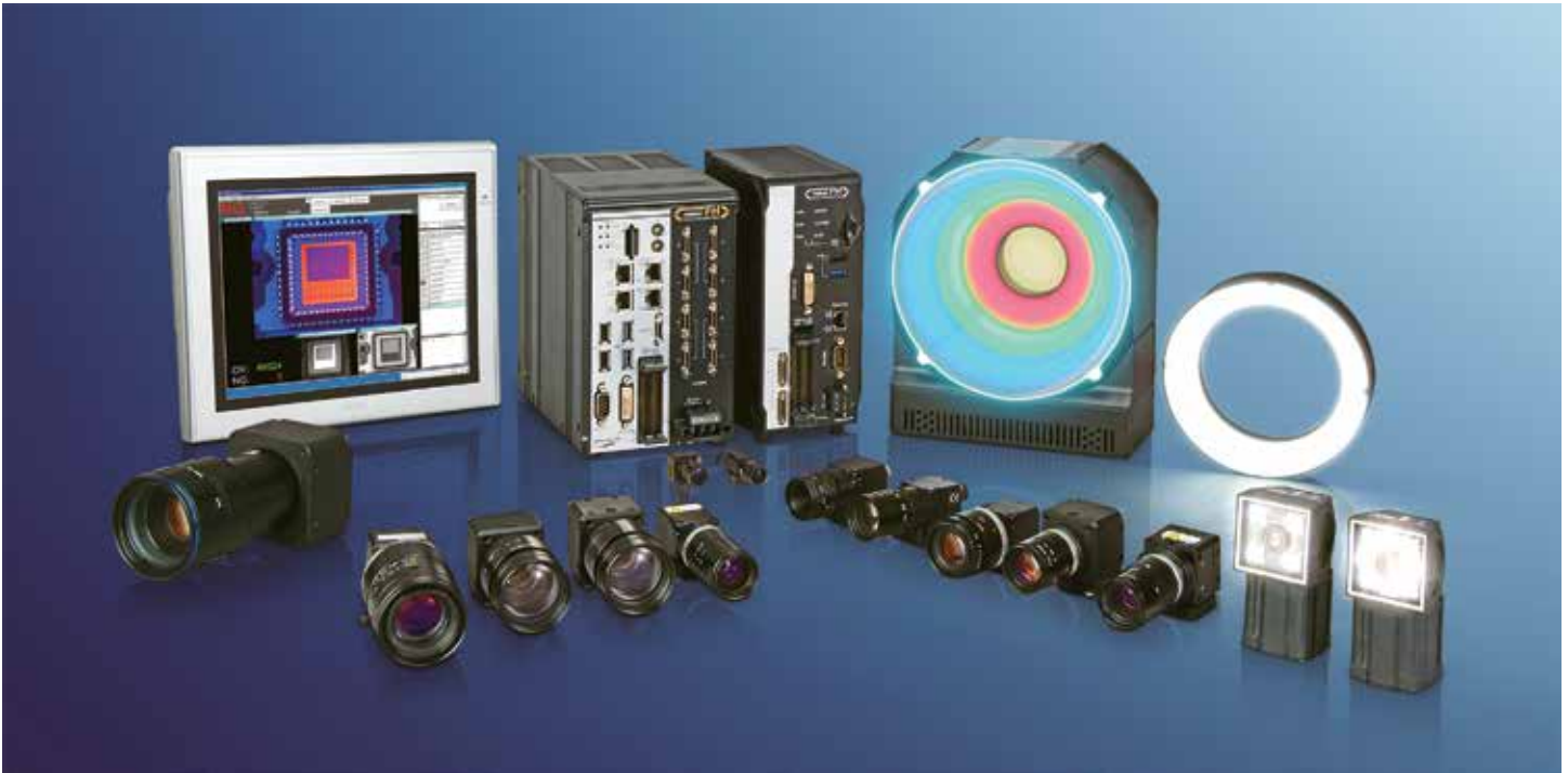
FH series vision system – High-speed, high-accuracy inspection and measurement

The inspection camera was set up directly above the can, approximately 8 inches from its top and facing down onto the its flange area. A red low-angle ring light was set up just below the camera lens to highlight the flange, creating an excellent reflected ring on the flange of the can. The ring light causes