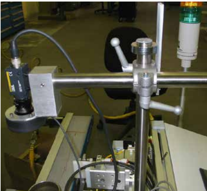
The camera and the low-angle ring light are mounted above the conveyor, with the camera's position capable of being manually adjusted in two directions.