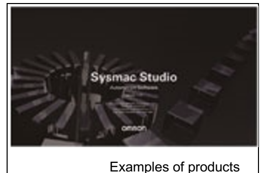
Examples of products

Model SYSMAC-□□□□□L, SYSMAC-RA401L, SYSMAC-SA4□□L-64, SYSMAC-SE2□□L, SYSMAC-TA4□□L, 3G8F7-CRM21, CXONE-□□□□D-V4(-UP), NS-NSDC1-V6(S), NS-NSRCL□□, NT-ZJCMX1-V4, WS02-CFSC1-J(-UP) VER2, WS02-CFSC1-JL□□ VER2, WS02-CFSC1-JV3(-UP), WS02-CFSC1-JV3L□□(-UP), WS02-CPLC□(-□□□), WS02-DRVC1, WS02-EDMC1(-V2L05), WS02-G9SP□□-V□, WS02-OPCC1-J(L10), WS02-SGWC1(□□□□), WS02-SPTC1-V2 < Refer to the "[ Details of applicable model ]" . >