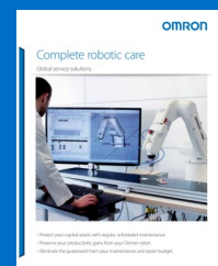
Robot Complete Care